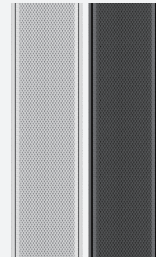
Two colors available